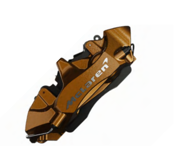
Bronze with Silver Machined McLaren Logo