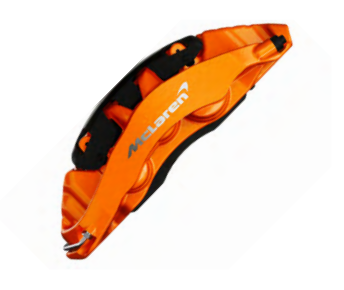
McLaren Orange with Silver Printed McLaren Logo