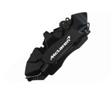
Anodised Black with White Printed McLaren Logo