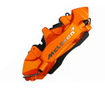
McLaren Orange with Machined McLaren logo