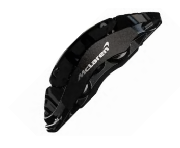
Black with Silver Printed McLaren Logo