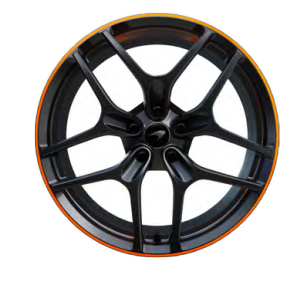
Stealth with McLaren Orange Border