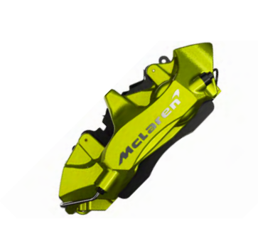
Flux Green with Sliver Machined McLaren Logo