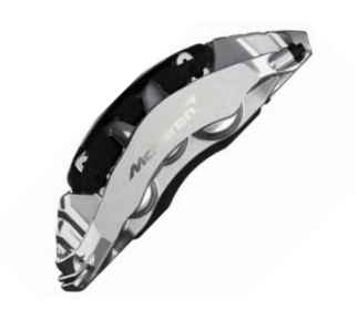
Liquid Silver with Silver Printed McLaren Logo