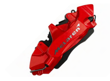
Red with Silver Machined McLaren Logo