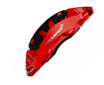
Red with Silver Printed McLaren Logo