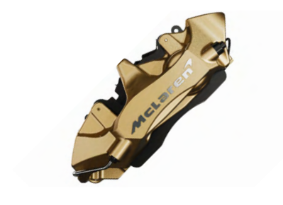
Speedline Gold with Silver Machined McLaren Logo