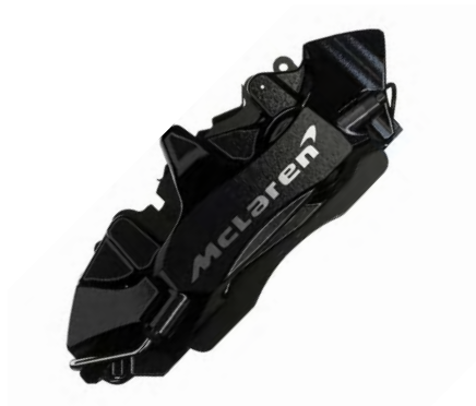
Black with Silver Machined McLaren Logo