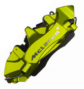
Flux Green with Silver Machined McLaren Logo