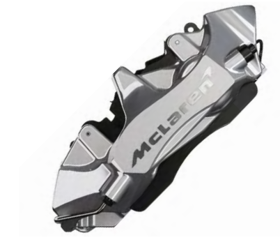
Polished with Silver Machined McLaren Logo