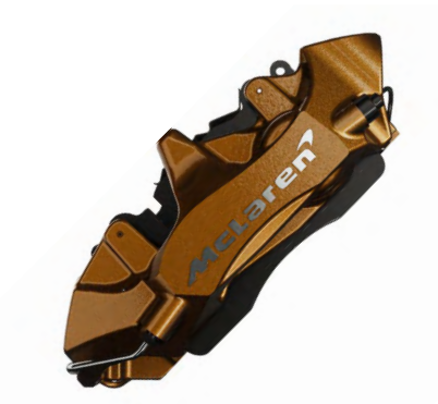
Bronze with Silver Machined McLaren Logo