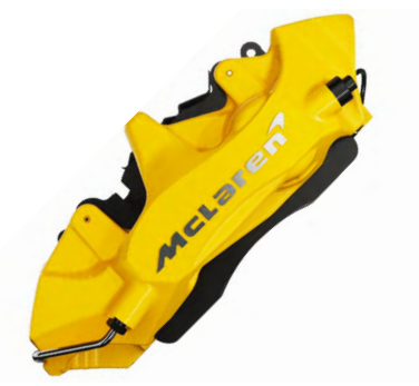
Yellow with Silver Machined McLaren Logo