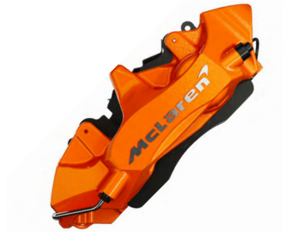
McLaren Orange with Silver Machined McLaren Logo