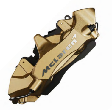
Speedline Gold with Silver Machined McLaren Logo