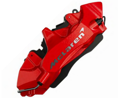
Red with Silver Machined McLaren Logo