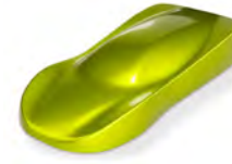
Flux Green II