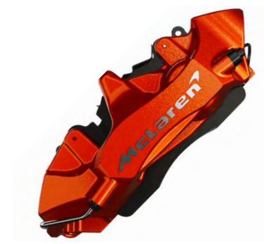
Azores with Silver Machined McLaren Logo