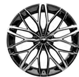
Gloss Black Diamond Cut