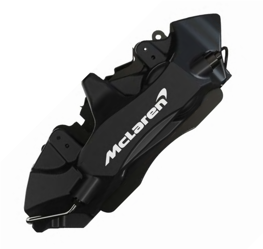
Black Anodised with White Printed McLaren Logo