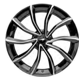
Gloss Black Diamond Cut