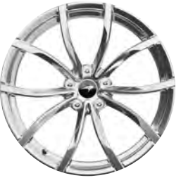
Titanium Liquid Metal