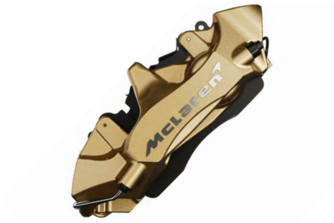
Speedline Gold with Machined McLaren logo