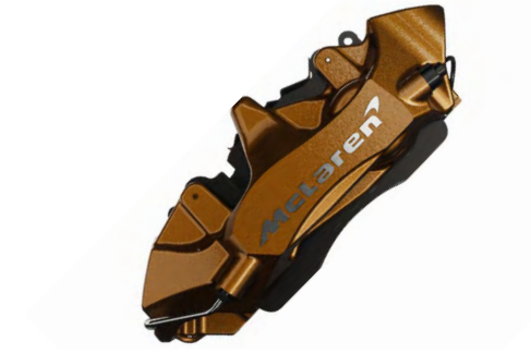
Bronze with Machined McLaren logo