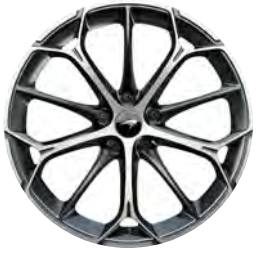
Stealth Diamond Cut