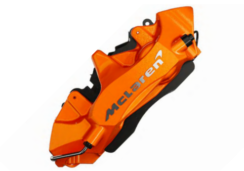
McLaren Orange with Machined McLaren logo