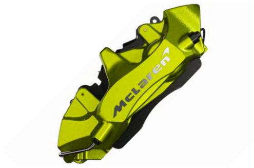
Flux Green with Machined McLaren logo