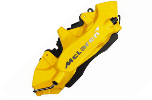
Yellow with Machined McLaren logo