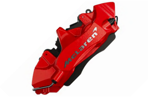
Red with Machined McLaren logo