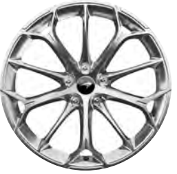
Titanium Liquid Metal