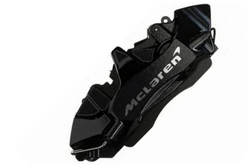
Black with Machined McLaren logo