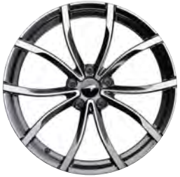
Stealth Diamond Cut